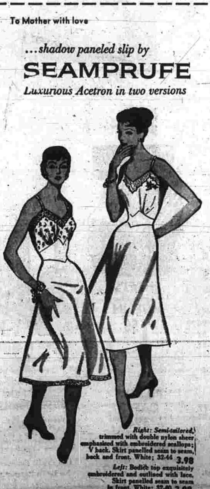
Right: Semi-colored, trimmed with double nylon sheer, emphasized with embroidered scalloped V back. Skirt paneled seams to seam, back and front. White; $2.48. 3.98 Left: Double top completely embroidered and outlined with lace. Skirt paneled seams to seam to seam. White; $2.48. 3.98

To Mother with love... A beautiful washable Lace Dress $8.98