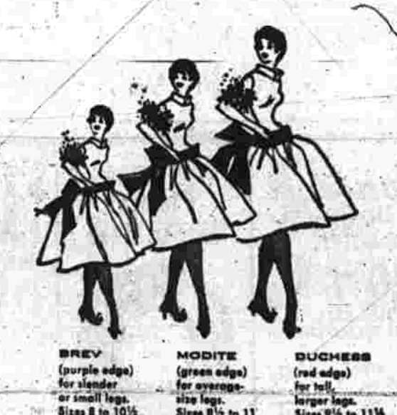
BRIVE (purple edge) for elegant or small legs. Size 8 to 10½. MODITE (green edge) for average-size legs. Size 11 to 11½. DUSKIER (red edge) for tall, larger legs. Size 11½ to 11½.

Give her the MOST BEAUTIFUL Stockings in the world belle-sharmer NYLONS Full Fashioned Leg-size stockings The gift all mothers need every day, every week, every month of the year. Here's one gift that's easy to buy and sure to please. Buy her a box of three pairs. We will gift wrap at no extra charge. Buy a box of 3 pair — we'll be happy to gift wrap! $1.35 to $1.95 She will love the stockings that makes all the difference in being well-dressed... the flattering straight line of the seams on Belle-Sharmer Leg-Size Stockings... the line that tells you Belle-Sharmer Stockings are shaped to fit from top to toe.