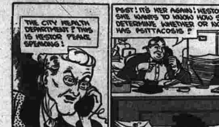
BOOTS AND HER BUDDIES